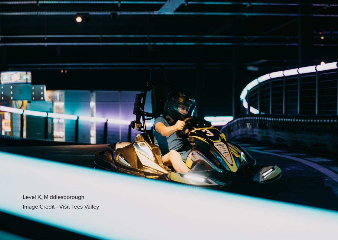
Level X, Middlesbrough