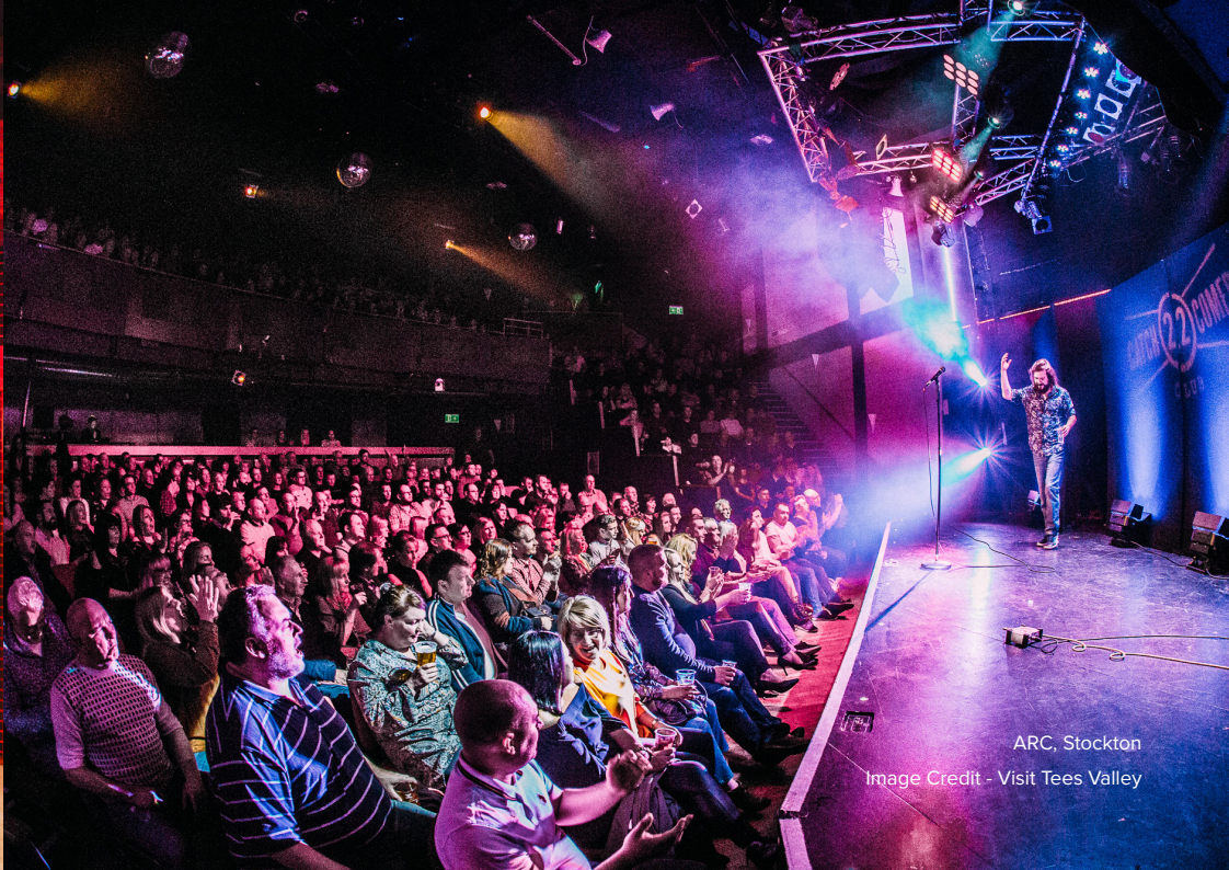
ARC, Stockton