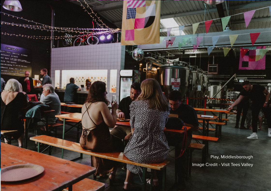
Play, Middlesbrough