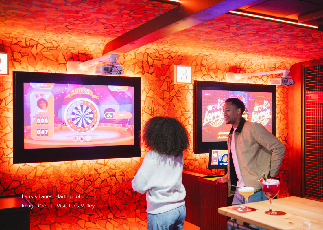
Larry's Lanes, Hartlepool